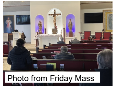
Photo from Friday Mass