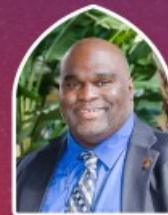
DEACON HAROLD BURKE-SIVERS