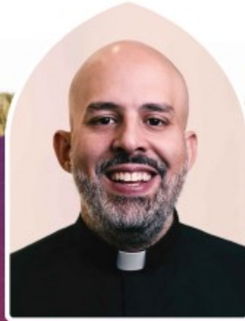
BISHOP JOSEPH ESPAILLAT