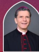
ARCHBISHOP GUSTAVO GÁRCIA-SILLER