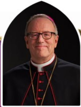
BISHOP ROBERT BARRON