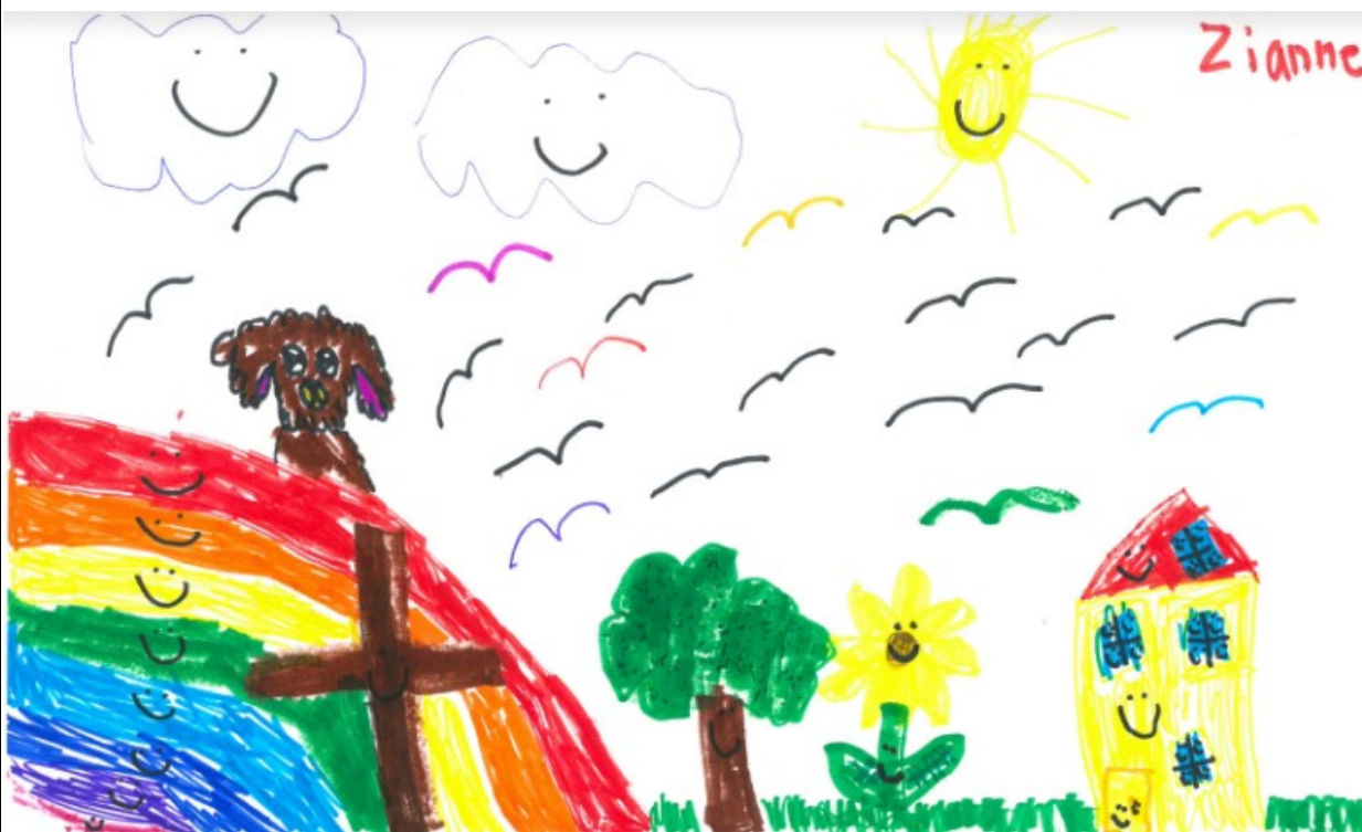
Illustration by Zianne Ballesteros