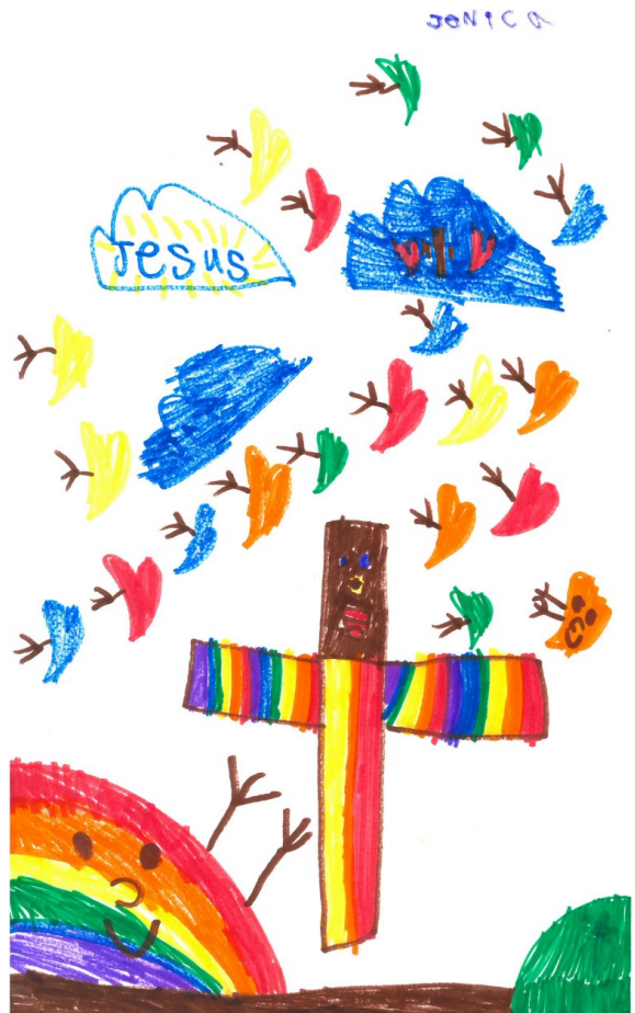
Illustration by Jenica Menor