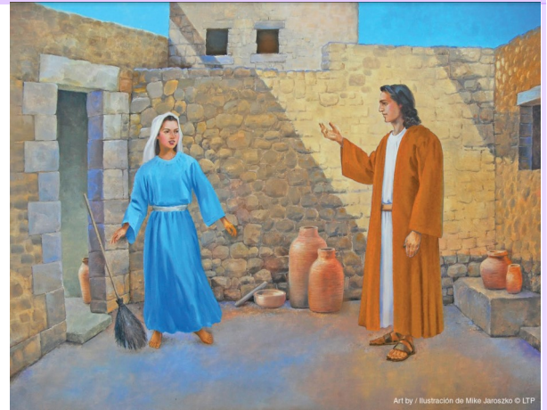
Art by / Ilustración de Miko Jaroszko © LTP