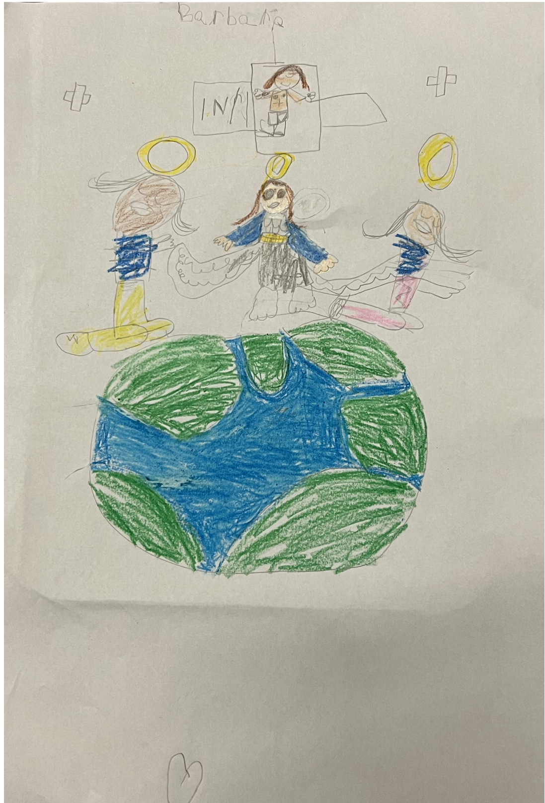
Illustration by Barbara Cadena