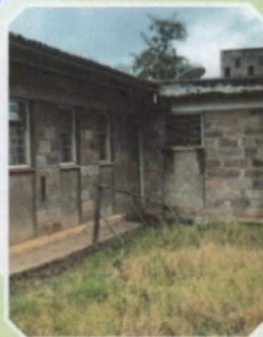
A section of seminary building at Philosophicum Campus which needs renovation