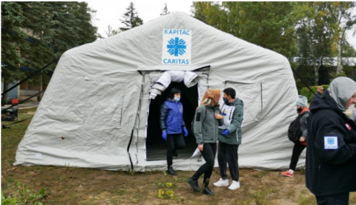
Caritas Ukraine teams conducted emergency simulations in October last year in preparation for a potential humanitarian crisis.

As reports emerge of families being displaced by the recent attacks in Ukraine, Catholic Relief Services is helping Caritas teams prepare to respond to urgent humanitarian needs across the country—including for evacuation, food and safe shelter—while taking every precaution to ensure the safety of their staff.