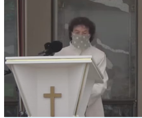
(Photos L to R) Sat. Jan 2nd Epiphany Drive-in Mass; church altar at the livestreamed Wed. Jan. 6th Adoration; our Sat. Jan. 2 Lector.