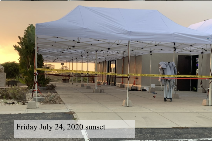
Friday July 24, 2020 sunset