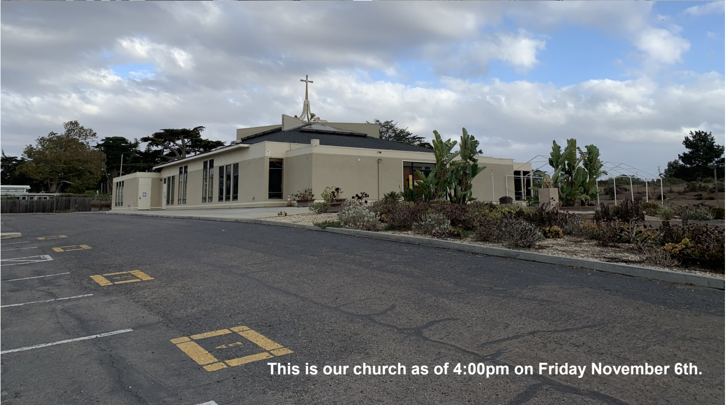
This is our church as of 4:00pm on Friday November 6th.