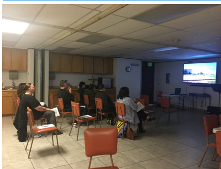
4 evenings of Lenten Reflection "A Lent to Remember"