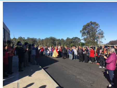
Blessing of Palms, Palm Sunday, March 25, 2018. 9 am.