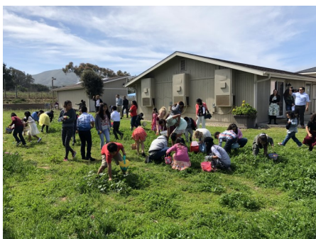
Kids' Easter Egg Hunt 1 April 2018, 11 am