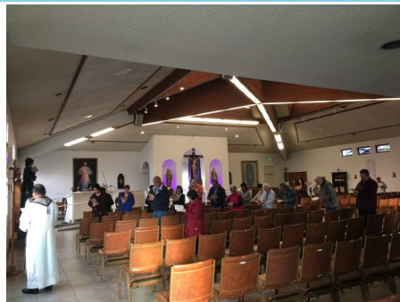
Fridays Stations of the Cross and Soup Suppers