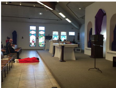
Good Friday liturgy, March 30, 2018. 3 pm