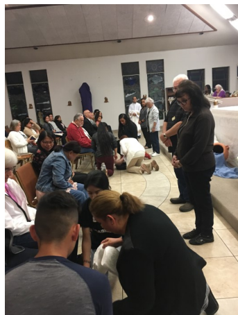
Washing of the Feet, Holy Thurs- day, March 29, 2018. 7 pm