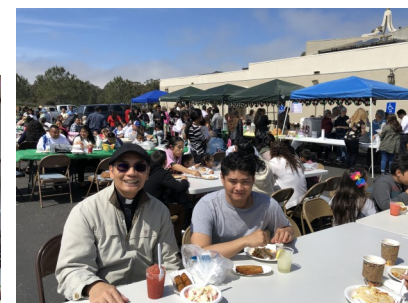
Kermis (Food Sales) Easter Sunday, 11 am 1 April 2018

Note: (see colored photos in parish website > bulletin)