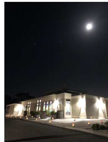
"Luminaries" by Confirmation students, Holy Thursday, March 29, 2018. 7 pm