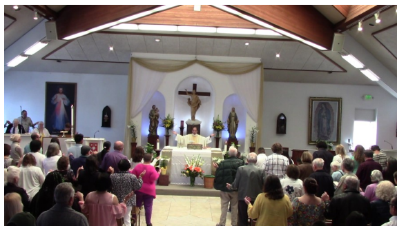
Easter Sunday 10 am Mass 1 April 2018