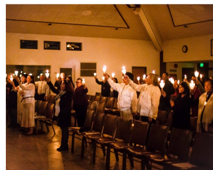
SEAS faithful & the Light of Christ Easter Vigil, Mar. 31, 2018. 8 pm