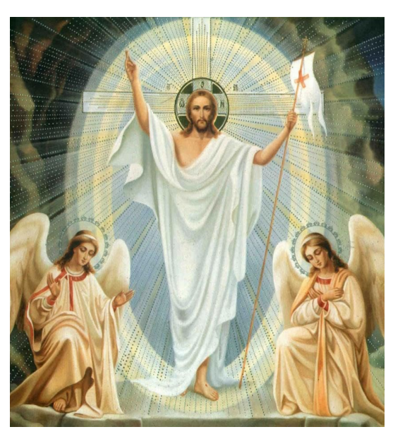
"When Christ your life appears, then you too will appear with him in glory." Col 3:4

Tues. and Fri. 9 am-1 pm Mon., Wed., and Thurs. closed