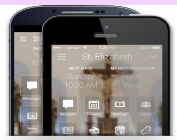
To download our app, visit myparishapp.com